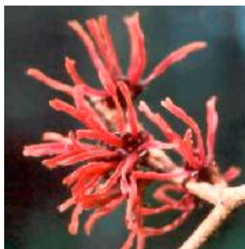
Hamamelis x intermedia 'Rubv Glow'