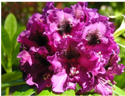
Red Hat Murder Mystery Oct. 2010