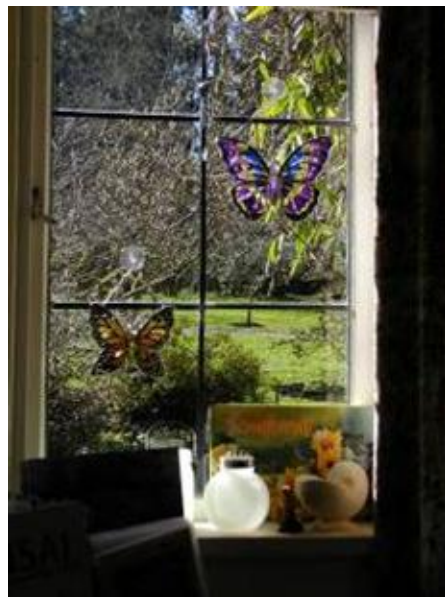
View to the orchard from the Magnolia Gift Shop

If you are interested in volunteering in the Magnolia Gift Shop please contact Candice.