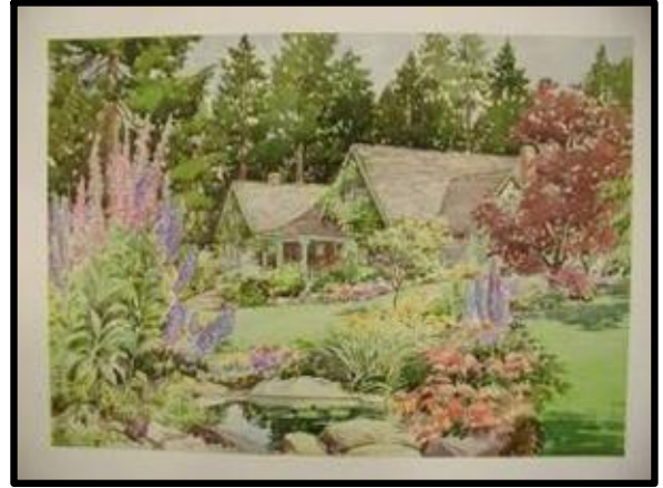
"Long Distance, Qualicum Beach" by Edward Goodall

Prints and cards are available in the Magnolia Gift Shop located in the Main House.