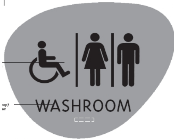
P.3 25mm legend; plus braille Tactile pictograms (typical)