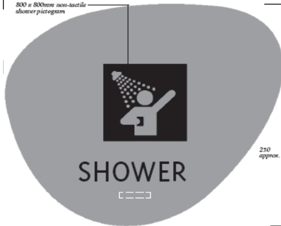
P.4 25mm legend; plus braille (typical)