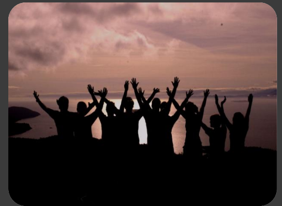
Bachelors Degree in

Recreation & Sport Management, & Tourism Studies