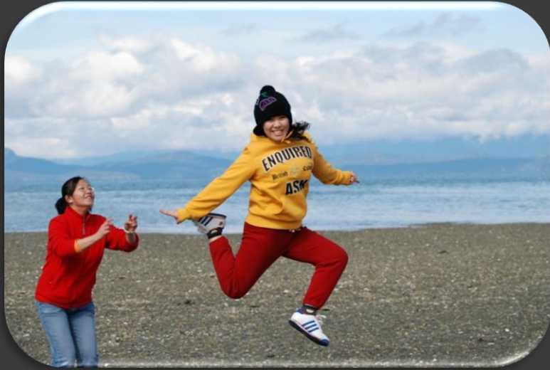
International Students Explore BC