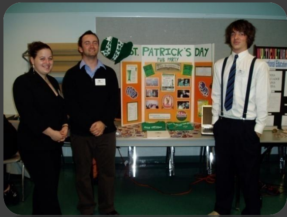
VIU's Areas of Concentration